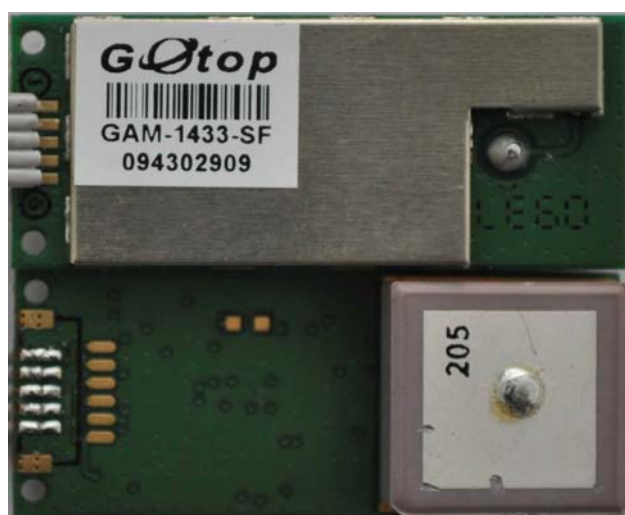
Figure 1: GAM-1433-SF Top View