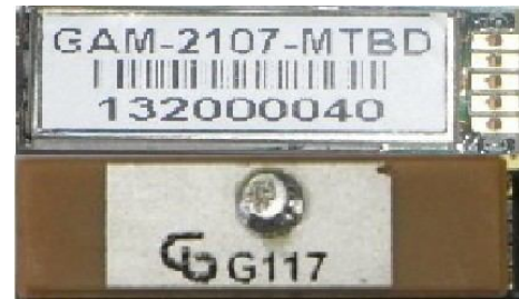
Figure 1: GAM-2107-MTBD Top View