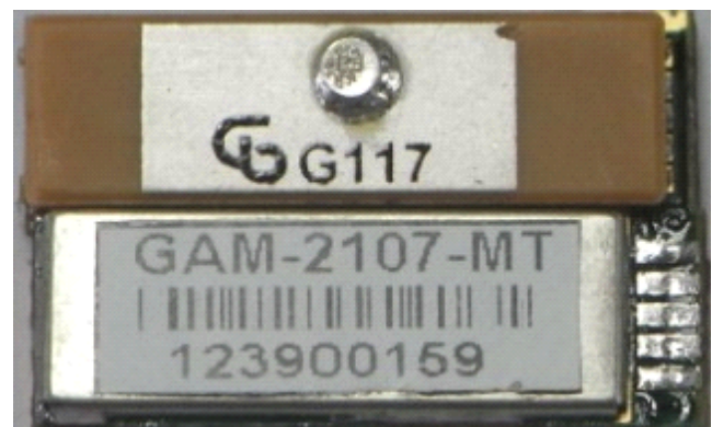
Figure 1: GAM-2107-MT Top View