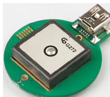
Figure 1: GAM-3831R-MTR Top View